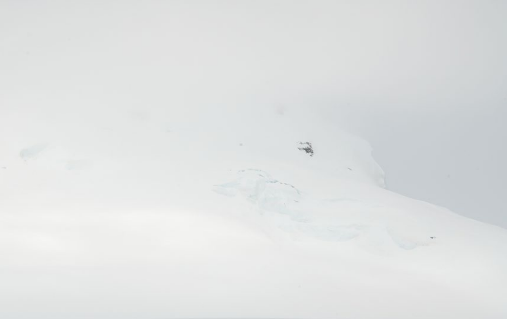
Figure 3 The removal of spatial perception, The Brocken, January 2018. COPY < IT > RIGHT.

is a place of extreme weather conditions; its peak lies above the natural tree line and tends to be covered in snow from September to May. Ghostly fog and mist shroud the top of the mountain for up to 300 days each year, often reaching down through the forests, valleys and peaks surrounding its summit. And sometimes, when the conditions are just right, the Brocken spectre appears: an optical phenomenon in which a person's magnified shadow is cast upon clouds, surrounded by a haloed rainbow. 4 Like Limenia, this apparition relies on convergence of the intangible; but, instead of computed manmade information, the Brocken spectre is an embodiment of natural imaging phenomena.