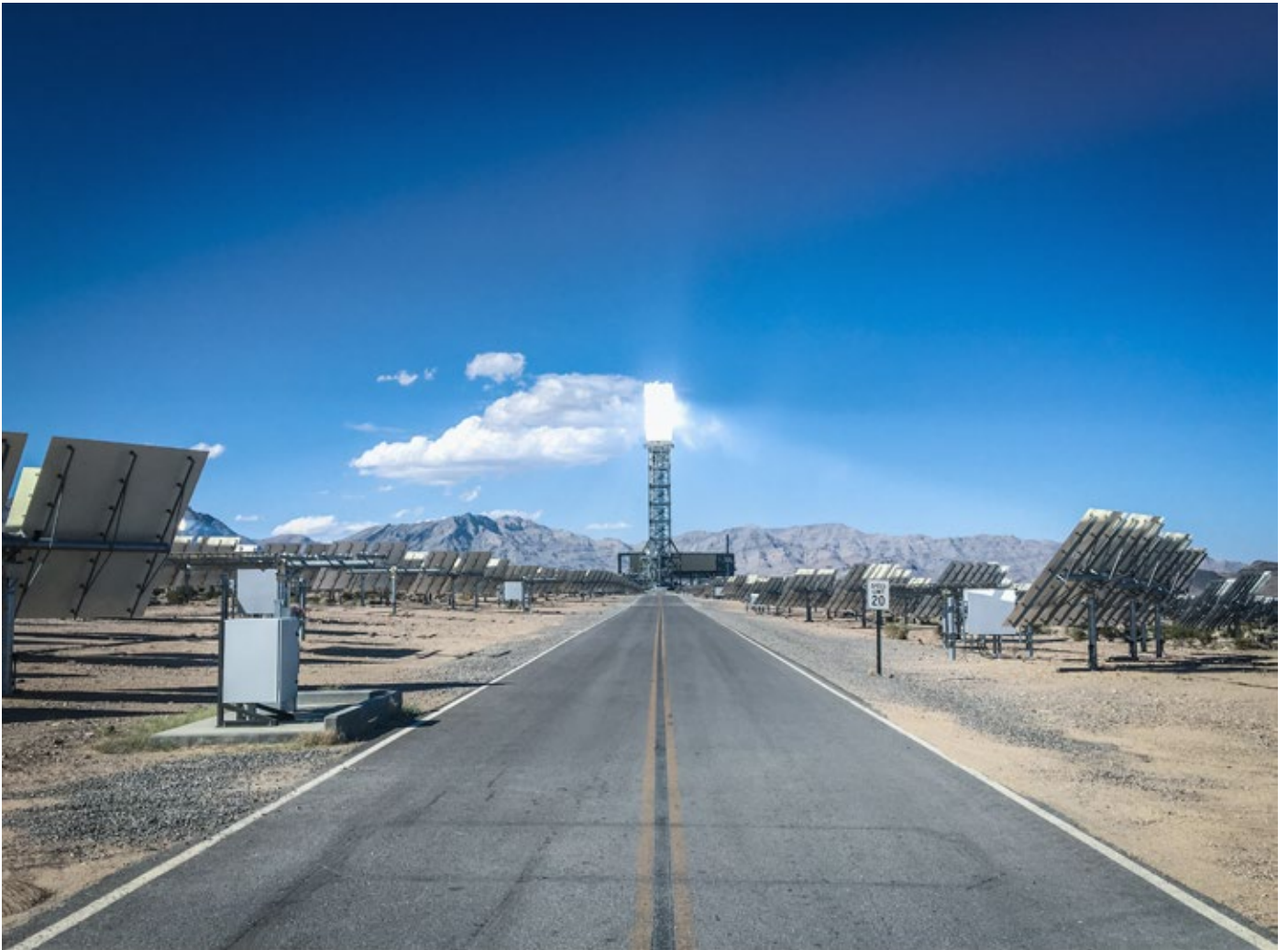
Figure 4 Flashback to a daylight lantern, Ivanpah Solar Power Facility, Mojave Desert, California. COPY < IT > RIGHT.

Forty-five minutes later, I had crossed the distance separating me from the daylight lantern. As I pulled up on the private road of a centralised solar farm (fig. 4), I swung my door open and hurried towards the edge of the field to experience its energy, expecting to be told to move on by some patrolling security guard at any time. But it remained quiet, endlessly quiet. There, in front of the whitest light I had ever seen, I was alone, there was nothing else. No wind, no cars, not even a hum to signal the concentration of energy right in front of me. It was just me and the whitest light in the middle of the High Mojave Desert. I had never seen such white. I closed my eyes and suddenly lost the light. It might as well have been vantablack.